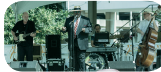
7/24 The Silky Ray Band (Blues)