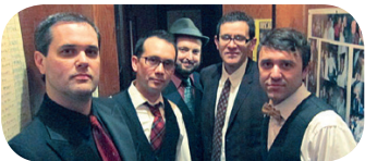
6/19 The Randys (Eclectic oldies)