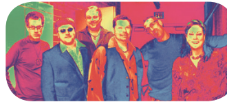
7/31 Agent 99 (‘70s rock)