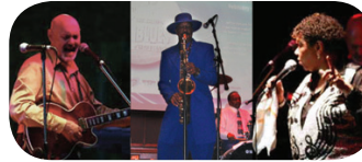
7/17 Inner City Blues Band (Blues/R&B)