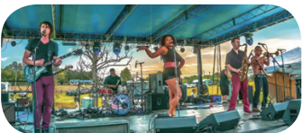
6/26 MojoFlo (Neo funk/soul)