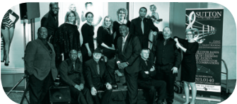
6/12 The Conspiracy Band (R&B/funk)