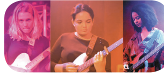
7/10 Cherry Chrome (Alt rock)