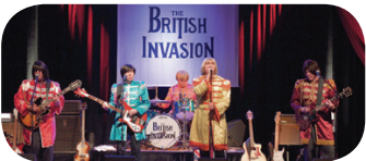
6/05 The British Invasion (‘60s music)

No rain location. Call 614-486-2951 after 6 pm about possible cancellation due to weather.