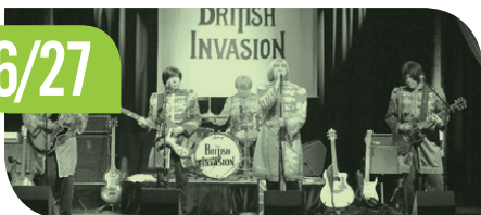
The British Invasion (‘60s music)