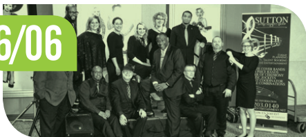
The Conspiracy Band (R&B/funk)